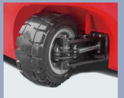
Smaller turning radius