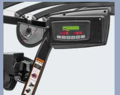
Easy to see display